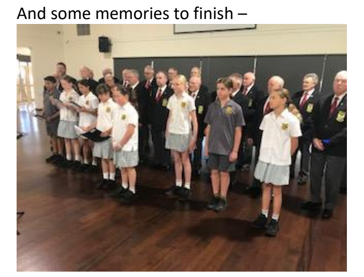
Singing in Geraldton.... Meeting some old friends in the pub