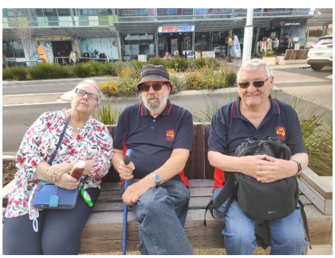
Resting in Margaret River.