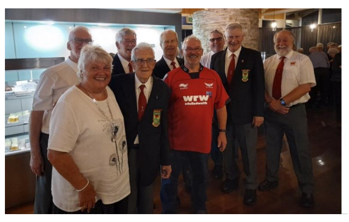
Singing in the pub at Kirks with Welsh visitors.

It's been a great year! Merry Christmas!