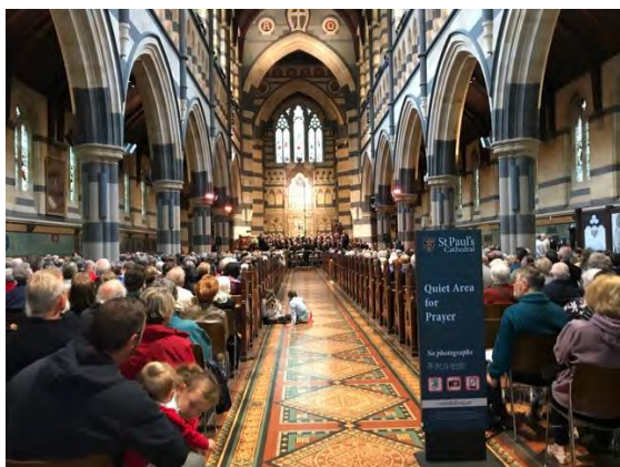
and here it is from the back!

This was the largest audience the choir has sung for as an individual group, and most choristers were very energised by the occasion. The Band reported similar sentiments.