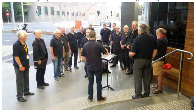
Warming up at Southbank.