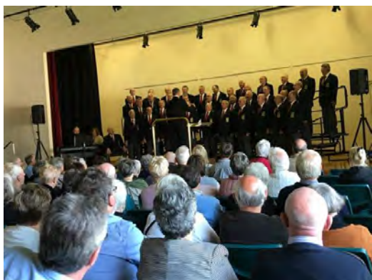
Phillip Island