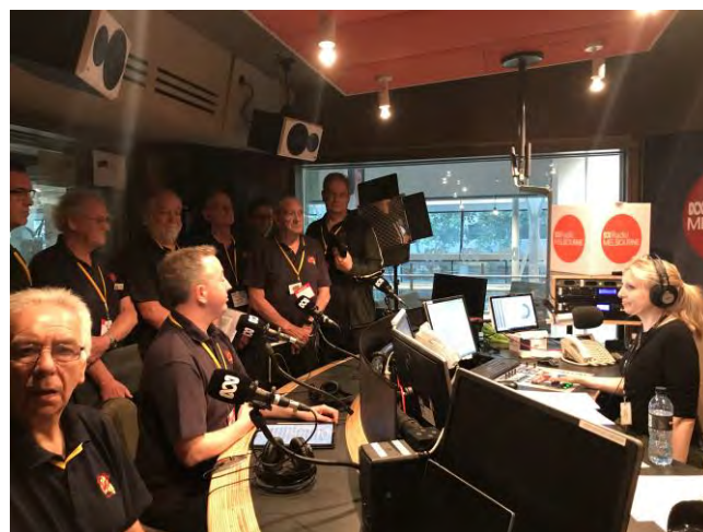
and inside... 1