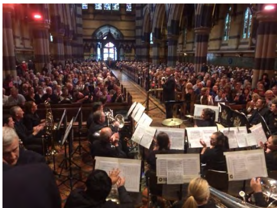
The audience at St Pauls from the choir risers

The result was spectacular! More than 1000 people filled the Cathedral to capacity.