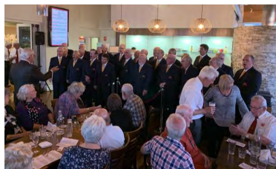
Melbourne Welsh..

Singing in the Pub in November carried on the Welsh culture theme evident at St Pauls, since our guest choirs were Melbourne Welsh Male Choir and the Mornington Peninsula Welsh Ladies Choir.