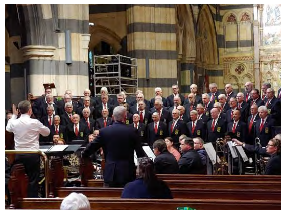
Rehearsing

this was the largest group he had ever played for.